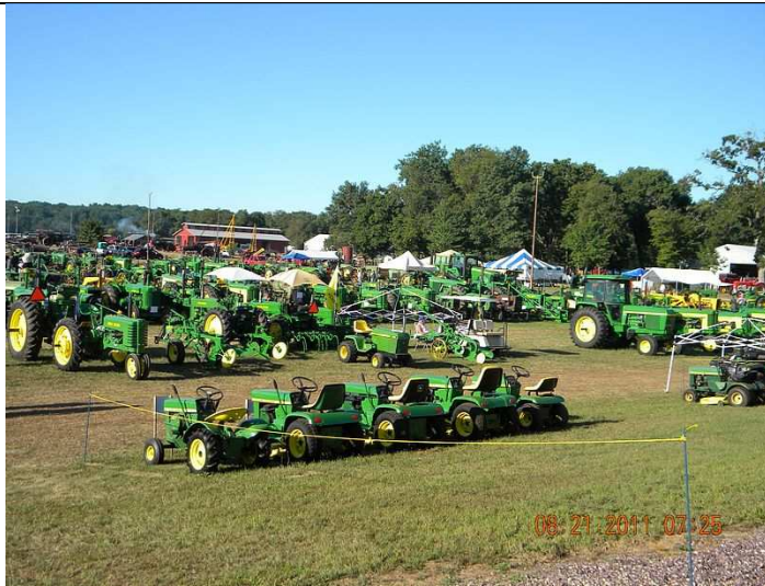
Fields of (John Deere) green