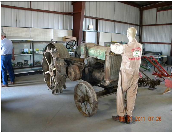
An antique tractor with steel wheels