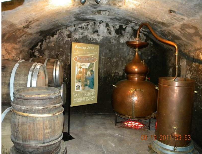
An antique brandy still