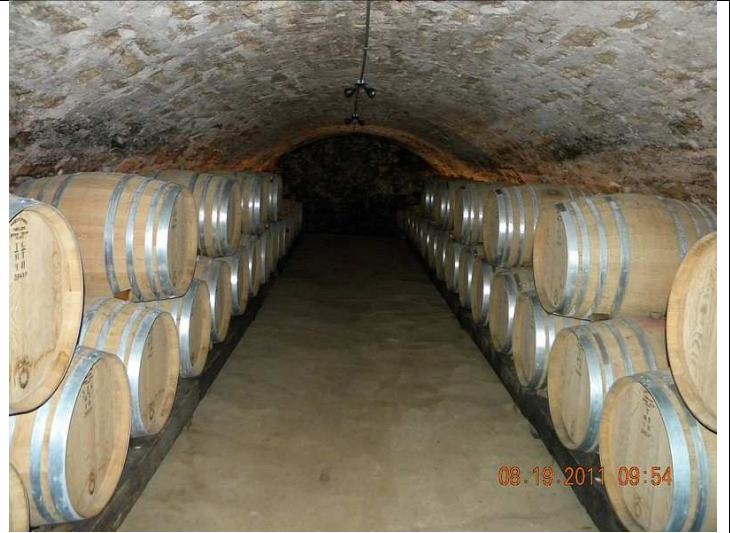
Wine aging in oak barrels