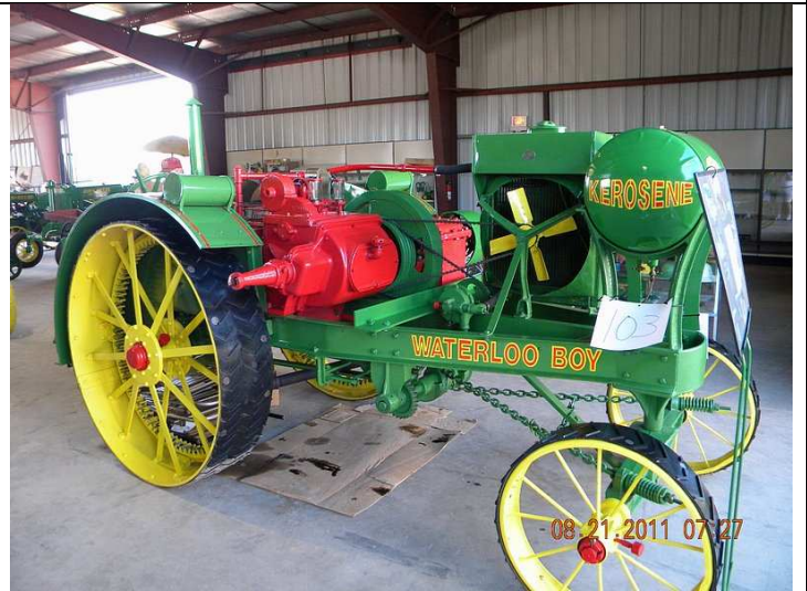
This antique tractor sold for $190,000.