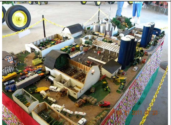
A miniature farm layout with many working vehicles