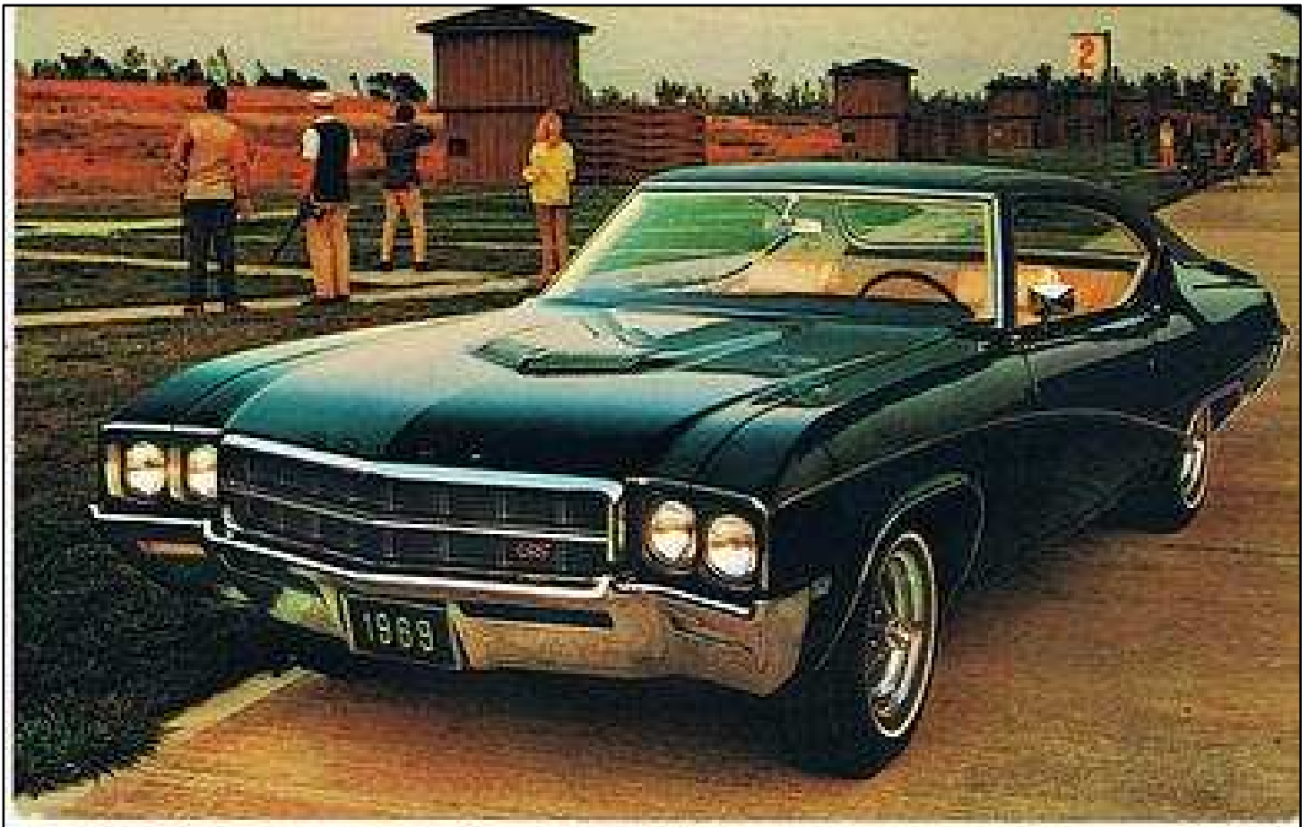
Postcard with 1969 GS 400.

March 19, STL Sports Hall of Fame Restaurant (Pujols), 7:30 p.m.