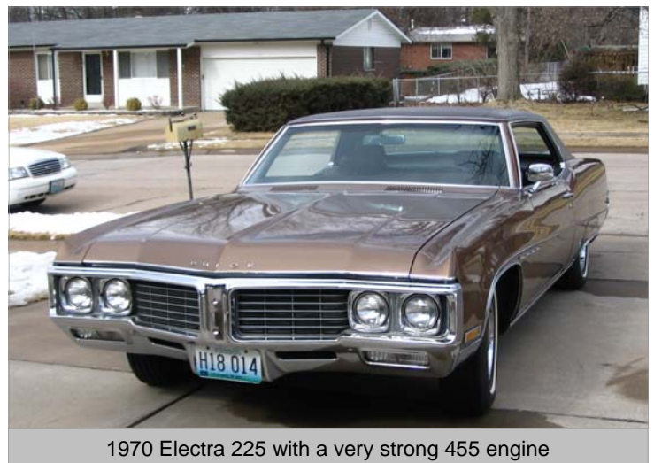
1970 Electra 225 with a very strong 455 engine

There is a reason for the missing emblem on the front of the '70 Electra 225. John keeps it in the glove compartment most of the time. The emblem is plastic and on the leading edge of the car and finding a replacement if this one should be stolen or broken would be almost impossible.