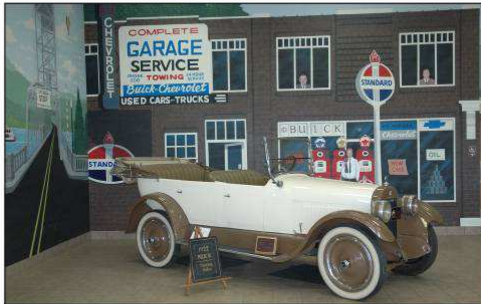
1922 Buick in front of a mural of the original dealership location in downtown Stillwater and the historic Stillwater bridge in the left background.

FREE T-SHIRT FOR EACH CAR REGISTERED. PARTICIPANTS WILL BE SHUTTLED TO HISTORIC STILLWATER FOR LUNCH OR ANTIQUE SHOPPING