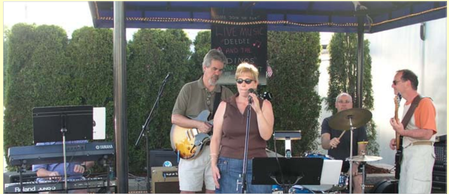
The Band (Can you spot the one on the keyboard?)