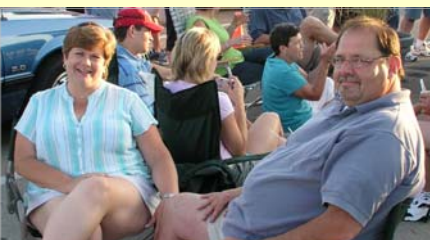
Prospective members with a '70 GS. Follow-up needed?