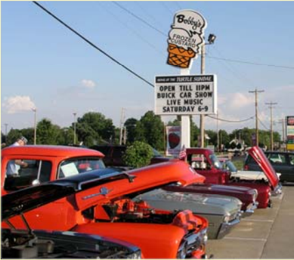
The AACA had a couple of trucks along with their cars.