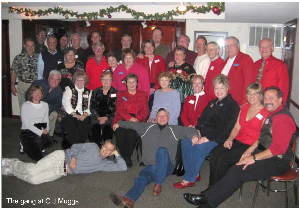
The gang at C J Muggs