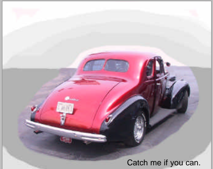
Catch me if you can.

Whitey is expecting to see more photos since your editor showed up apparently snapping quite a few shots. But can you expect your editor to have the film threaded in correctly?